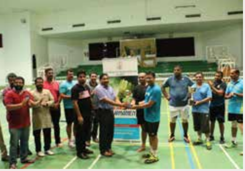
ADMYTS Badminton Winners